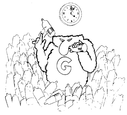
We throw away 2.5 million plastic bottles every hour (22 billion plastic bottles every year)!